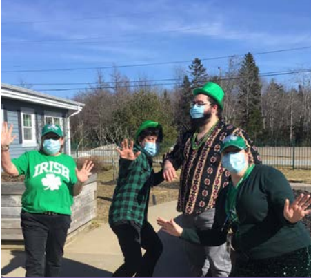
Happy Saint Patrick's Day from the Whitehills Recreation Department