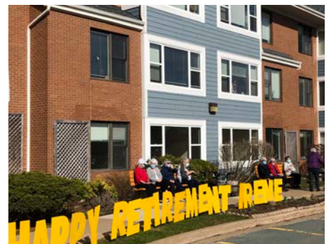
A grand send off from residents at Melville Heights!