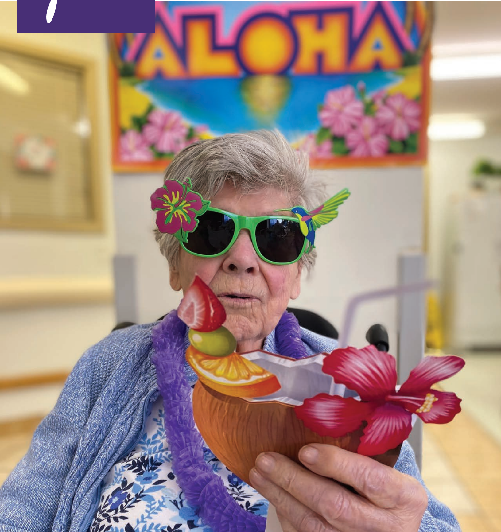
Gables Lodge resident ready for her Hawaiian vacation