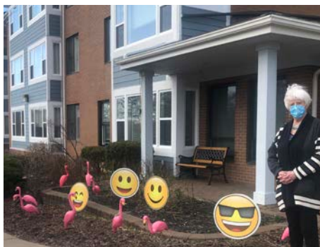
26 Famingos to celebrate