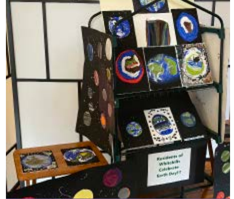
Residents at Whitehills explored the galaxy and created paintings to celebrate Earth Day!