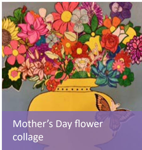
Mother's Day flower collage